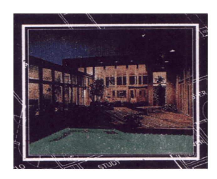
Office Brochure for: